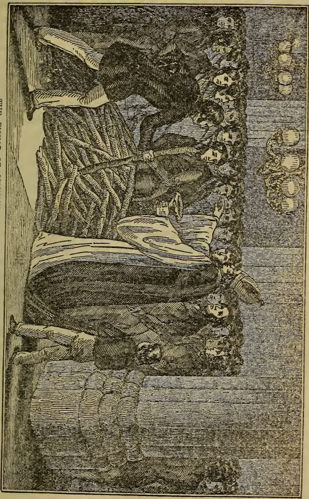
THE BISHOP OF PENNSYLVANIA BLESSING THE STICKS.—Part I., p. 114.